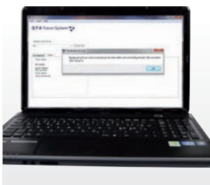
QTA Tracer with Bluetooth 4.0-technology